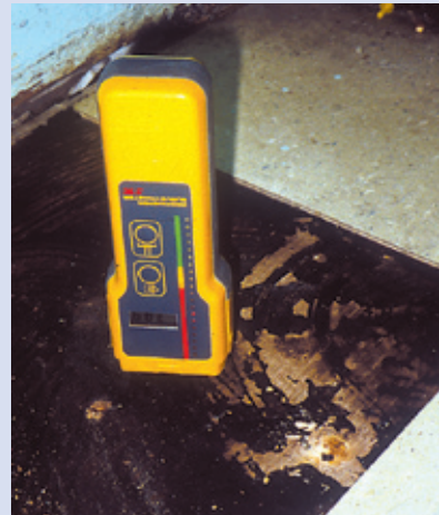
Photo 9: Moisture meter measuring moisture content of plywood subfloor