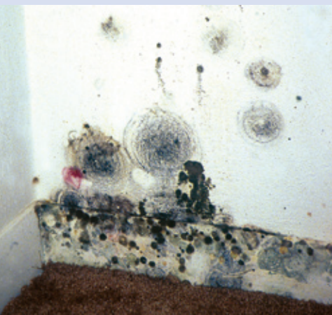
Photo 3A: Mold growing in closet as a result of condensation from room air