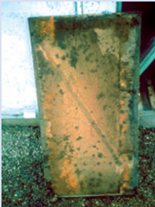
Photo 4A: Contaminated fibrous insulation inside air handler cover

Do not run the HVAC system if you know or suspect that it is contaminated with mold. If you suspect that it may be contaminated (it is part of an identified moisture problem, for instance, or there is mold growth near the intake to the system), consult EPA's guide Should You Have the Air Ducts in Your Home Cleaned? 4 before taking further action (see Resources List).