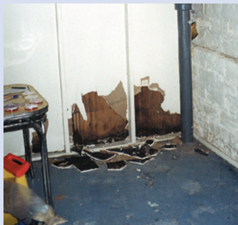
Photo 3B: Front side of wallboard looks fine, but the back side is covered with mold